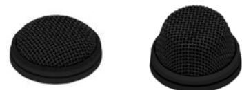
Logic control buttons MAS 1 TC | MAS 2 TC